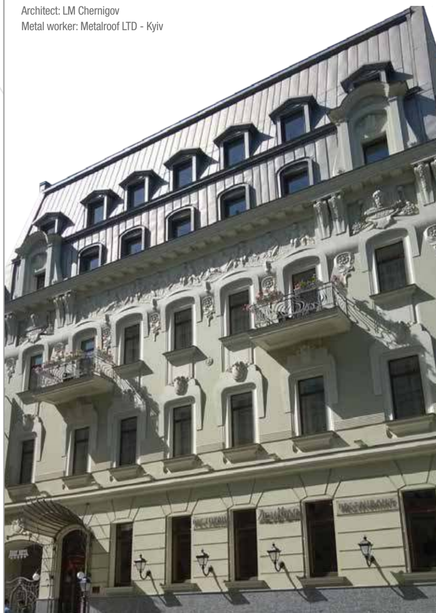
Location: Ukraine Material: NedZink NOVA Architect: LM Chernigov Metal worker: Metalroof LTD - Kyiv