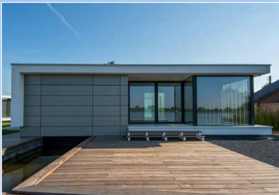
Location: Reeuwijk - The Netherlands Material: NedZink NOVA COMPOSITE Architect: Lab32 architecten - Geulle Metal Worker: Sign Display - Zwanenburg / Bouwbedrijf Valkenburg bv Nieuwerkerk aan den IJssel